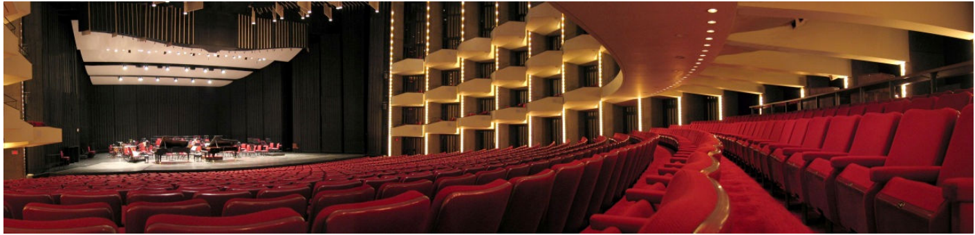
National Arts Centre, Ottawa, ON, Canada

New York, London, Hong Kong,... ACS-installations can be found around the globe.