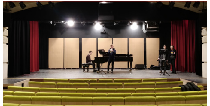
University Auditorium: From voice-lift to choir all in this relatively small room.

Klanghaus Mein Schiff 3, TUI Cruises, Germany