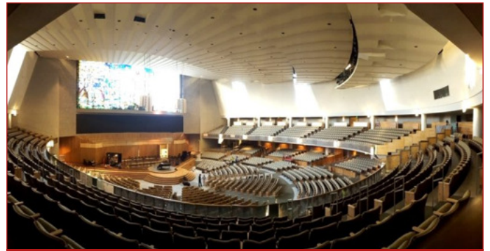
Church: Select acoustics for amplified speech, congregational singing, choir and bands, during a service.

Royal Opera House, Linbury Theatre, London UK