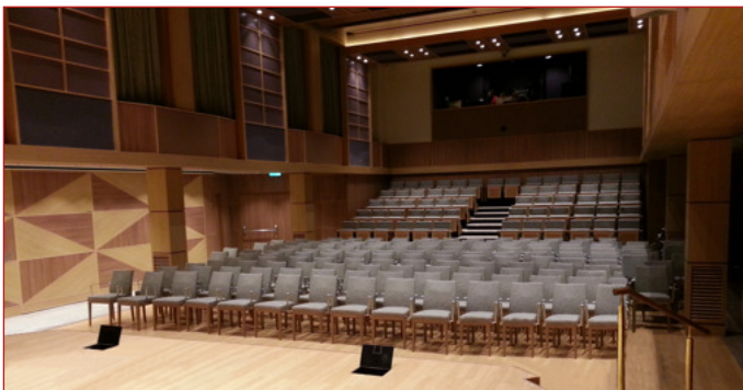
Cruise ship: Create a concert hall at sea.

Church of the resurrection, Leawood, KS USA