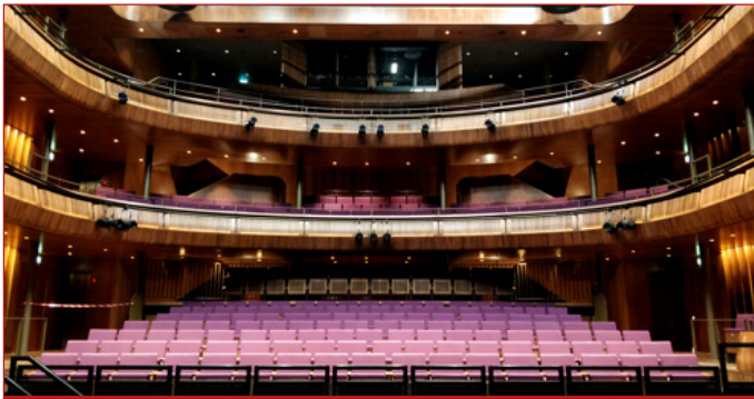
Opera Theatre: Eliminate dry natural acoustics and make it appropriate for Opera.

ACS has been installed in many different venues, large and small, to improve the acoustics for performers and audience and to make the acoustics variable. It is used for good music acoustics also in smaller halls, to add early energy for clear detailed music in larger halls, to make halls suited for multiple applications or to create a true concert hall at a place you would not expect. Below are a few examples